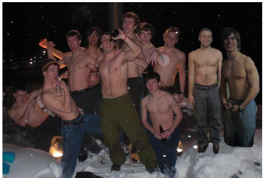
The Omicron Xi pledge class of 2010 attempts to look cool and manly by taking off their shirts and flexing together. Also, that is root beer.

the affairs and scandals I've unfortunately lost all respect for Eldrick and his cheating ways. According to his personal statement released on February 19 th he urged fans worldwide to "find room in your heart to one day believe in me again". As a pure blooded American from Langhorne I urge readers to turn from Tiger and block any room in your heart to believe in Tiger. He's an idiot.