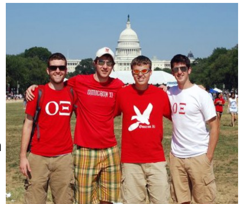
Alums and actives at our nation's capital!