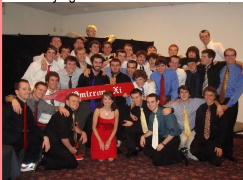
Okies and their Sweetheart at the Spring Formal

Thanks to all of you who have contributed your input via the survey to further the bond between Okies of past and present. As you will see on the bottom of this newsletter, your contributions are being put into practice as we develop and grow a formal alumni association to keep the bonds of our fraternity tight.