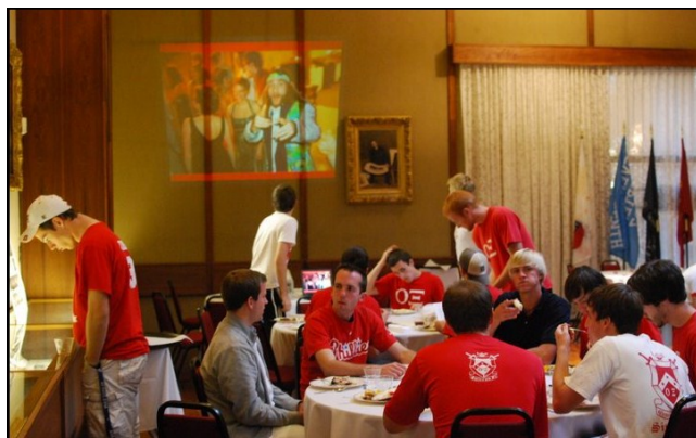
Actives and Alumni enjoying the annual Homecoming dinner