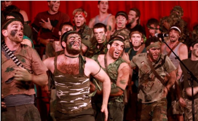
Okies performing "Survivor" at Greek Sing 2010