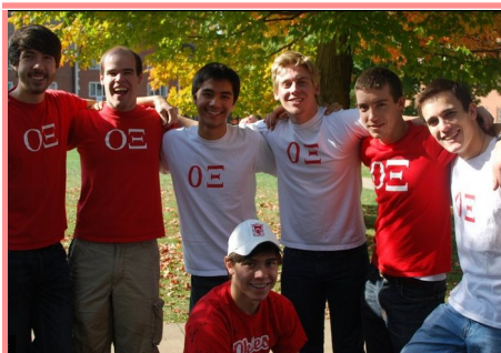
The Joy of Our College Days...

I can't believe another year has passed us by. It was wonderful seeing many of you for Homecoming this past Fall and we look forward to seeing many of you again. Homecoming is