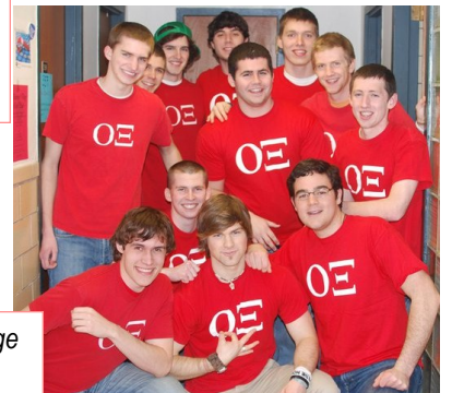
(Left) The Omicron Xi pledge class of 2011