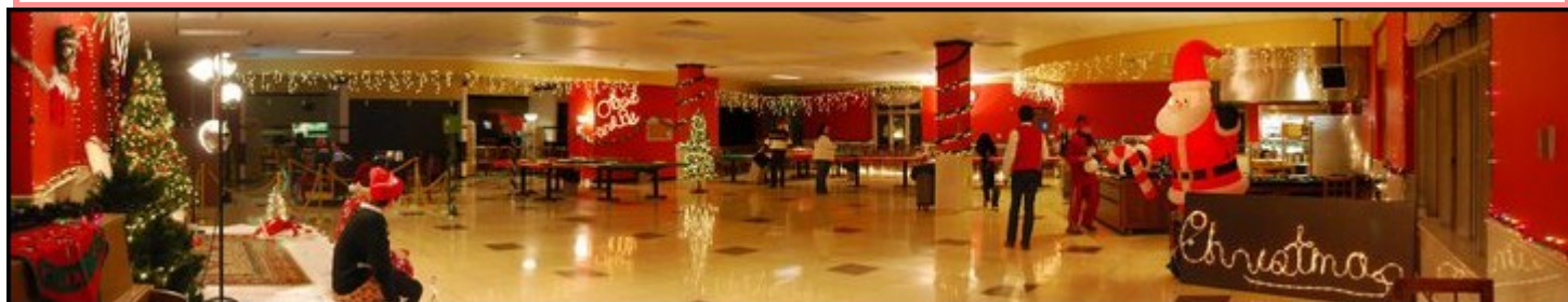
The setup of MAP Cafeteria before the Okie-Pi Christmas Party