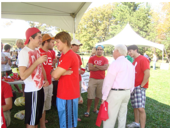
Okies at the homecoming tent 2010

In sticking with the electronic medium, the Okies took their talents to the Internet even more intensely joining the online Twitter and YouTube communities. You can search for vides filmed, starring, created by Okies at www.youtube.com/user/omicronxi1947 . You can also follow our tweets on Twitter at @OXI1947. You can also find us on Facebook by searching for Omicron Xi (it is a private group, so a request must be approved by an administrator.)