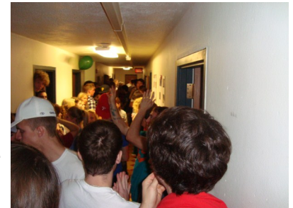
An outrageous party called Okiepalooza

The Okies are known for throwing outrageous parties from Okiepalooza with the infamous, potentially deadly, probably a lawsuit waiting to happen, Apple Bobbing Relay, to the Party that Put Christmas on the MAP that we the throw with Epsilon Pi. Omicron Xi is known for being able to have an absolutely ballin time, yet also honor God with the same breath. Okies always have and will continue to be leaders on campus and in our community. Our fraternity, like any group, has experienced change throughout the years. But the bond that we share is still the same: we have our fraternal bond that binds us together as brothers, and we have our eternal bond which binds us with our lord Jesus Christ.