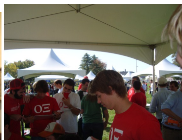
Above: Homecoming Tent 2010.